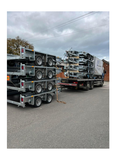
Page 1 of 11