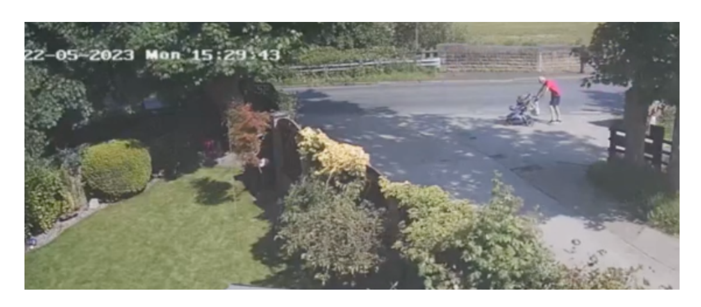
Page 4 of 11